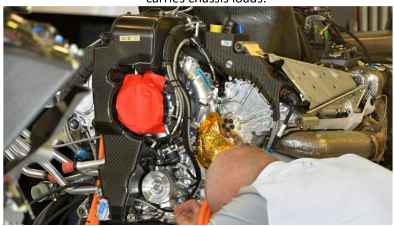
DASO Racecar Engineering April 2014

The triangular part over the cambox probably reinforces the beam stiffness of the engine, which carries chassis loads.