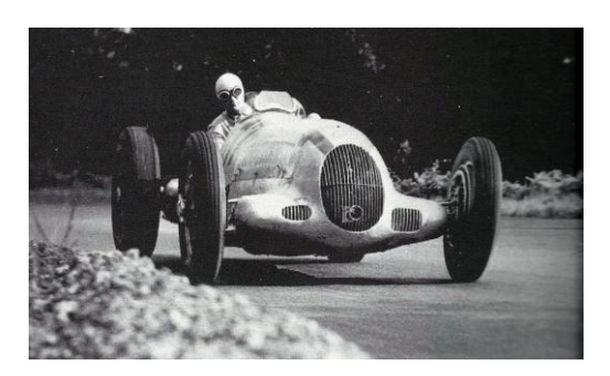
Fig. 2 1936 Mercedes-Benz Short W25 The drivers who crashed one of these cars.

Louis Chiron, who crashed in the 1936 German GP.